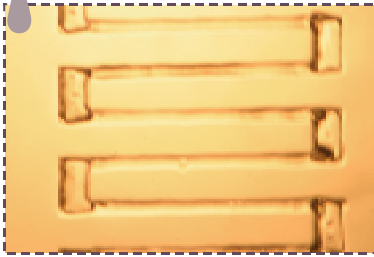
Optical image of the PDMS micromixer.