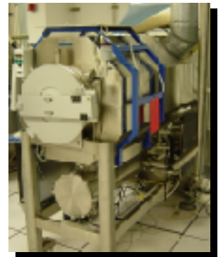
ALD process & reactor.